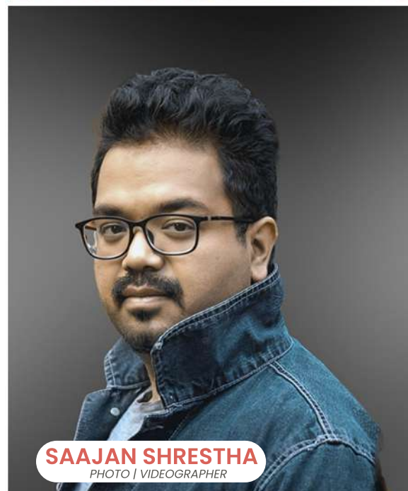
SAAJAN SHRESTHA PHOTO | VIDEOGRAPHER